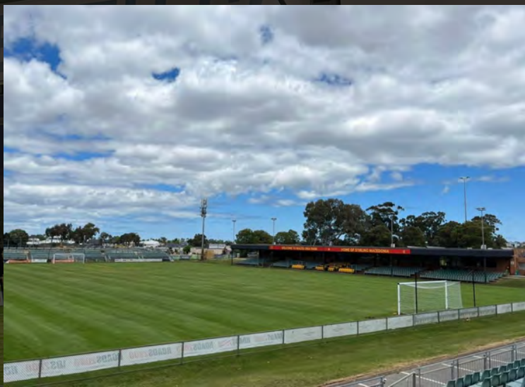
Macedonia Park - home of Stirling Macedonia, my first club in Perth. They currently play in the WA NPL

The facilities at the semi-professional level in Australia can vary throughout the leagues. You have clubs at the NPL level with nice stadiums and some clubs with no stadium or stands. You also have the same at the State League level. Clubs do have to meet certain facility requirements which means the majority of clubs have nice facilities and great playing surfaces.