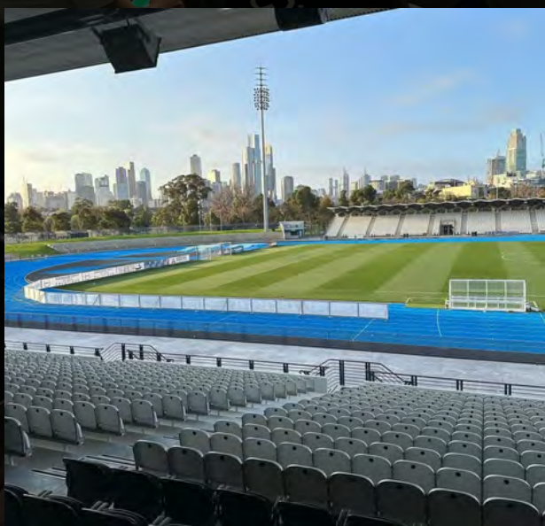
Lakeside Stadium - home of South Melbourne FC. One of the biggest NPL clubs in Melbourne